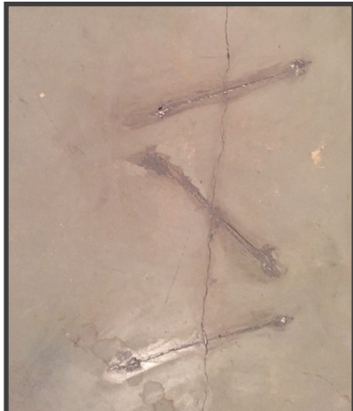
SINGLE BLADE WIDTH

The Concrete Crack Lock™ is installed by making a single blade saw cut in the concrete across the crack and then drilling two small holes at each end. The cut is then filled with Rhino High Strength Epoxy Paste, and the Concrete Crack Lock™ is inserted. The Concrete Crack Lock™ requires less concrete removal and epoxy than other similar crack repair products, thus saving time on installation.