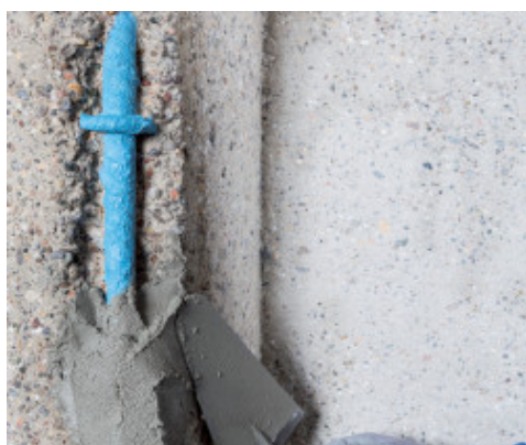
Applying Planitop Smooth & Repair R4 with a trowel

Apply the mortar with a smooth trowel in a single layer from 3 to 40 mm thick without using formwork. As soon as the mortar starts to set, tamp the surface with a sponge float. The waiting time required before carrying out this operation depends on surrounding weather conditions. To paint and protect the surface, apply a coat of an elastomeric product from the Elastocolor range or an acrylic product from the Colorite range. The finishes available may be chosen from product's relative colour chart or from a much wider range of shades available using the ColorMap® automatic colouring system. If the structure to be repaired is subject to high dynamic stress, it may be advantageous to apply a 2 mm thick layer of flexible smoothing and levelling compound such as Mapelastic Guard or Mapelastic Smart before applying the coloured finish. In such cases, Elastocolor Paint must be used for the coloured finishing coat.