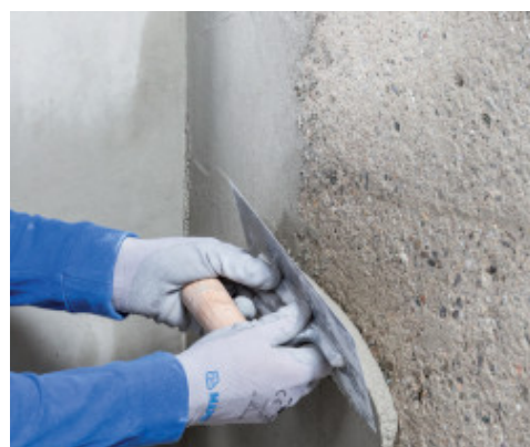
Applying Planitop Smooth & Repair R4 with a putty knife