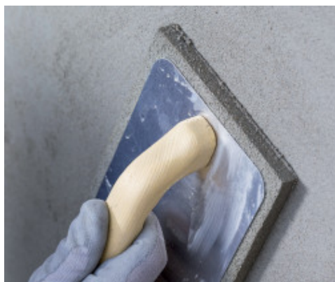
Floating the surface of Planitop Smooth & Repair R4