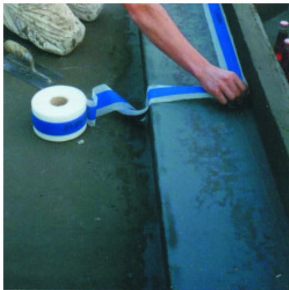
An example of Mapeband waterproofing a corner between the bottom and a side of a bath tub