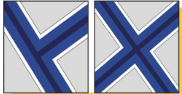
Positioning of special T profiles Positioning of special cross profiles