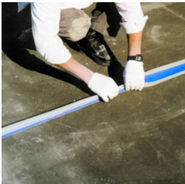
An example of waterproofing an expansion joint on a terrace