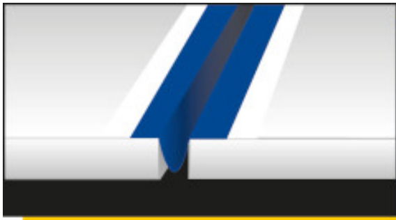
Ω positioning of Mapeband inside an expansion joint