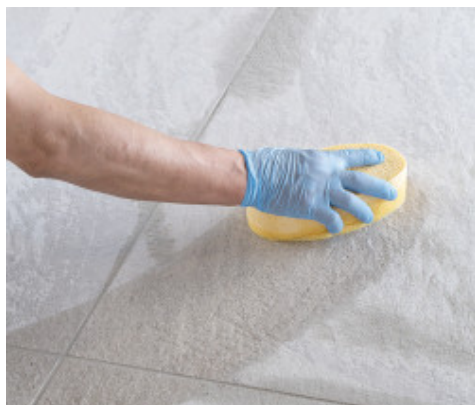
Cleaning and finishing grouts with hard cellulose sponge