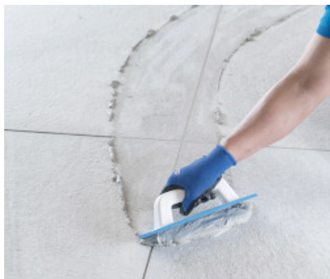
Application of Keracolor GG with MAPEI float

For the use of products from the UltraCare range, please refer to the relative Technical Data Sheets.