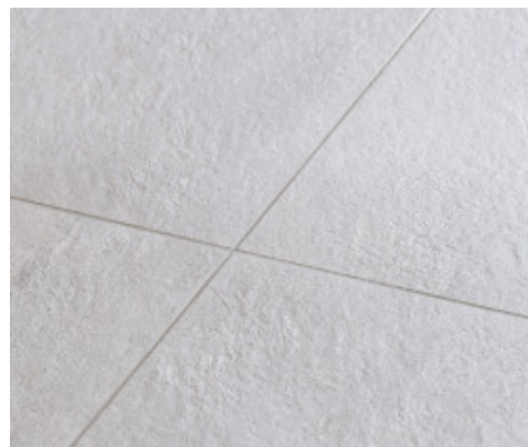
Floor grouted with Keracolor GG