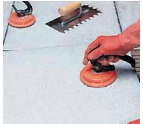
Laying large size tiles