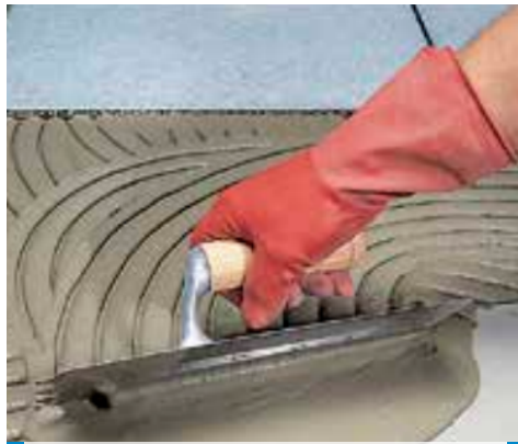
Spreading with semicircular notched trowel