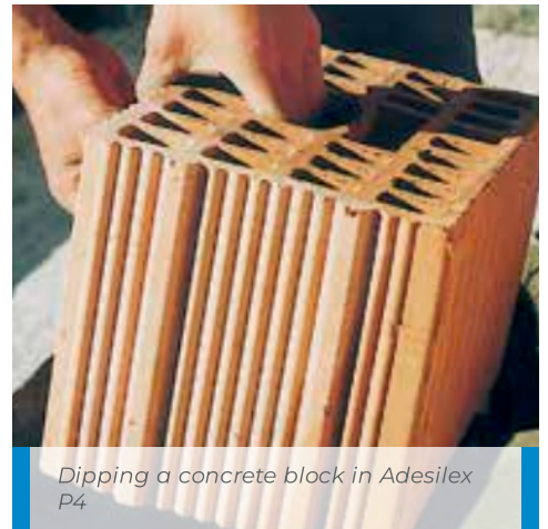
Dipping a concrete block in Adesilex P4