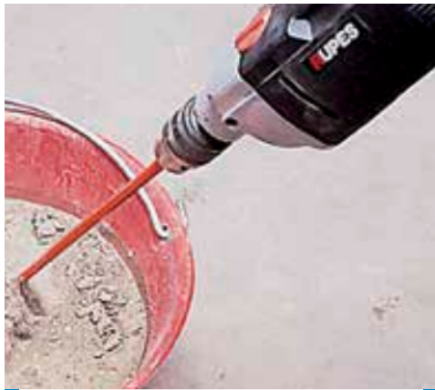
Mixing Adesilex P4

12 months in a dry, elevated area in the original unopened packaging.