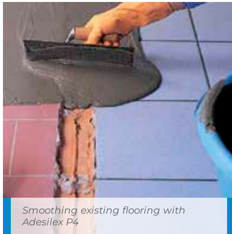
Smoothing existing flooring with Adesilex P4