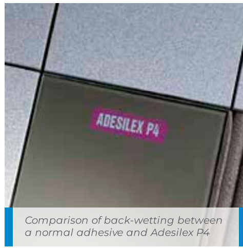
Comparison of back-wetting between a normal adhesive and Adesilex P4